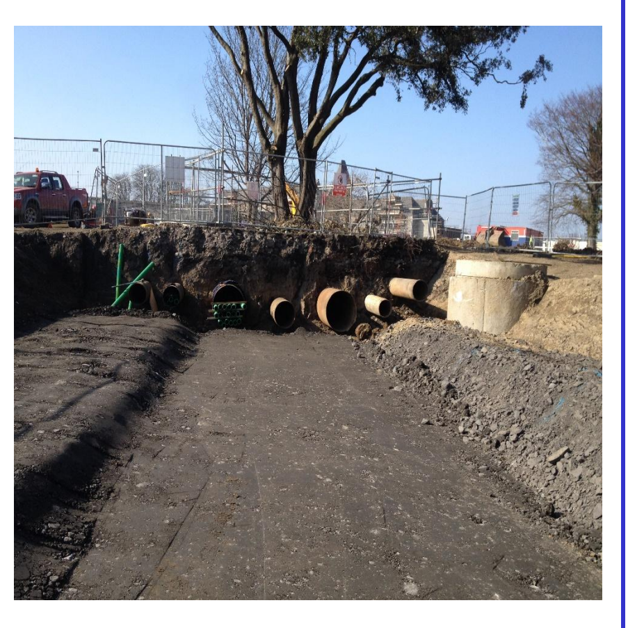
Pipes installed at Grangegorman, Dublin for service ducts.